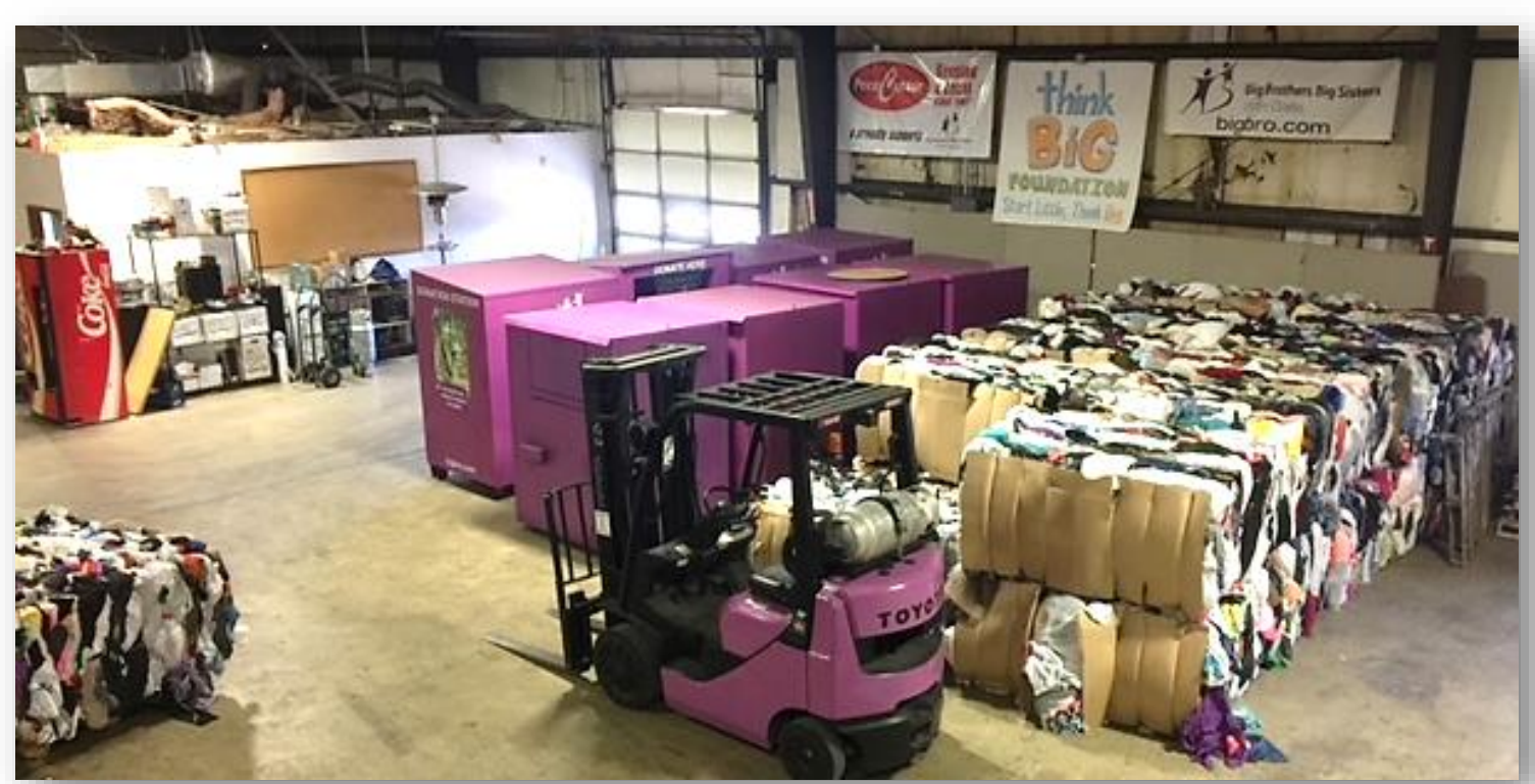
The Think Big Foundation warehouse