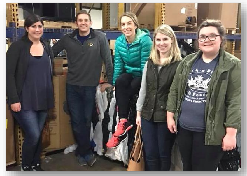
Thanks to this great group of Rotaract Club volunteers!